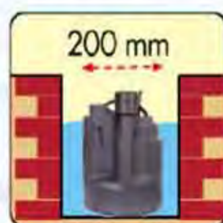
Ideal for limited space.

The ComPac Flotec pumps for clear water are designed to drain domestic water containing particles with a maximum diameter of 5 mm, empty and dry flooded rooms, draw water from wells, basins or cisterns.