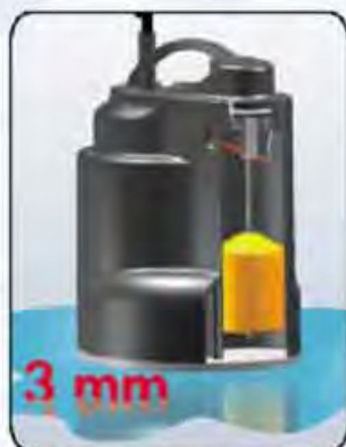
Integrated automatic floating switch. Draining level: 3mm with manual mode.