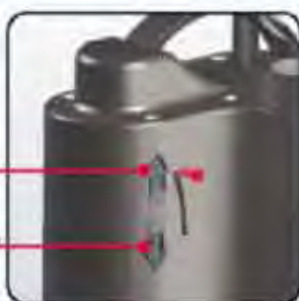
Automatic and manual mode.